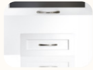
Snow White (Contemporary)