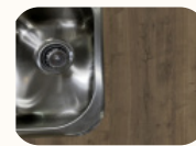
Planked Coffee Oak