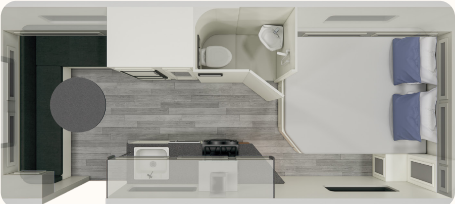
Escape 23 F3