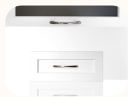
Snow White (Contemporary)