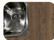
Planked Coffee Oak