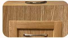
Oak (Special Order)

Choose from Oak, Maple, or Contemporary options.