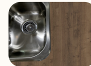
Planked Coffee Oak